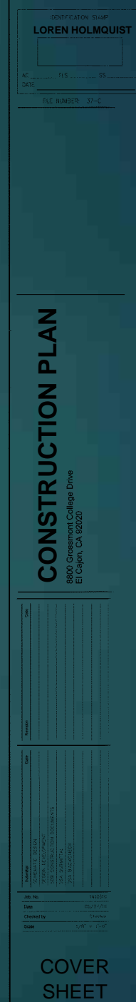
Bldg 51 & 55 Construction zone