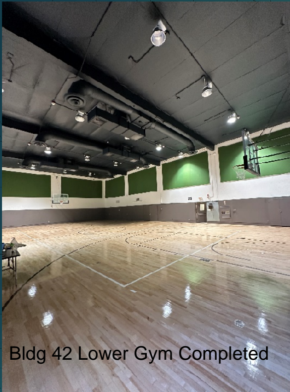
Bldg 42 Lower Gym Completed