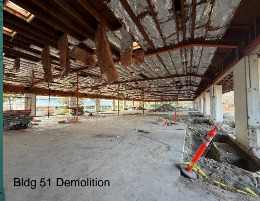
Bldg 51 Demolition